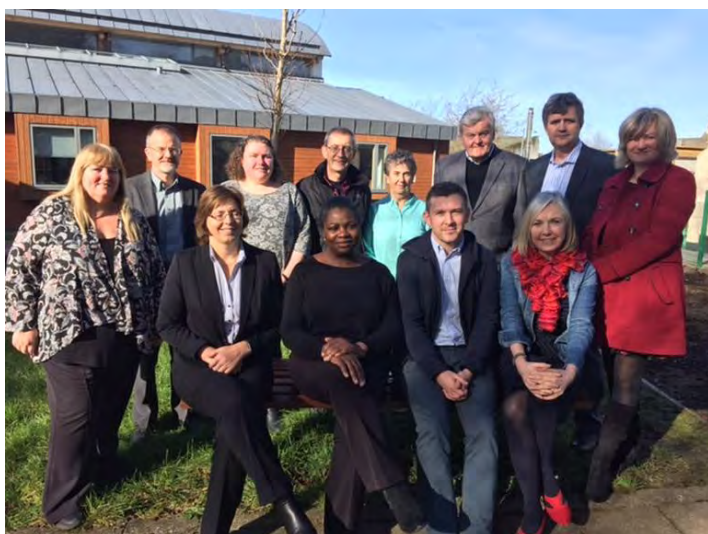
CDI Board of Management, 2018

There are established and efficient governance and sub committee structures supporting CDIs compliance with regulations and the Charities Governance Code. For more information on CDI Governance see http://www.twcdi.ie/about-us/governance-structure/ .