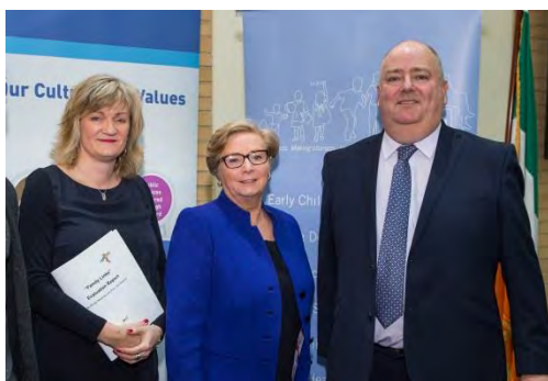
Launch of Family Links Report

The Evaluation Report, conducted by the University of Limerick, was formally launched by the then Tánaiste and Minister for Justice, Frances Fitzgerald in February 2017. The findings from the report were well received with the Irish Prison Services (IPS) committing to continue the roll out of Family Links. The launch received wide media coverage. The report can be found using the following link: https://www.twcdi.ie/wp-content/uploads/2016/11/Final-Family-Links-Evaluation-Report-January-2017-1.pdf