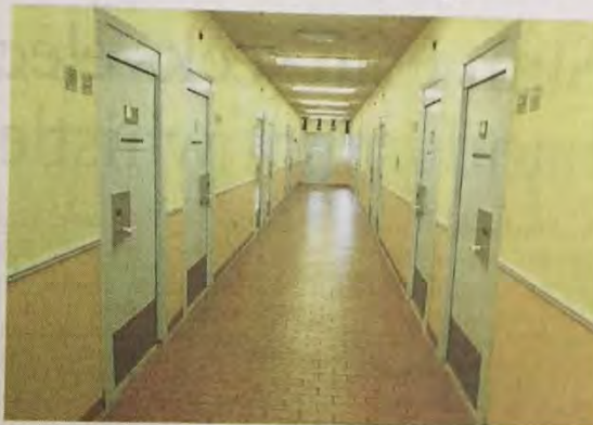
The programme, which is already in Wheatfield Prison, was of benefit to imprisoned fathers.